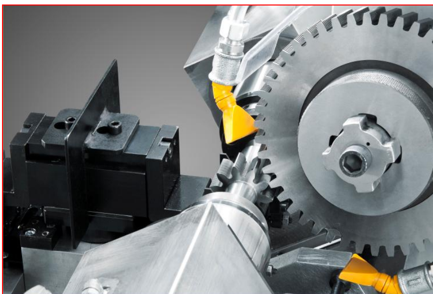
Picture # 4 – Gear shaving in the automotive sector performed by Sicmat RASO 200 Dynamic shaving machine

Relax, nothing has changed. The accuracy and the stability of the machine are still the same; the execution speed of shaving is the same, mixed cycles are performed as in the gear shaving machines so far offered by the market, and it is possible to change the working conditions during the same cycle. In short, the performance remains unaltered. Some functions will be surely lost, such as the ability to handle, through the same CNC of the machine, external functions like a complex multi-axis loader, or to manage additional heads for chamfering and de-burring. But all this is not necessary if you do not produce very large product quantities, and if you do, you need to go on using higher-end machines. The new Sicmat RASO 200 Dynamic gear shaving machine may cost slightly more than a reconditioned machine, but it is equipped with much more functionalities and is managed by a new generation numerical control.