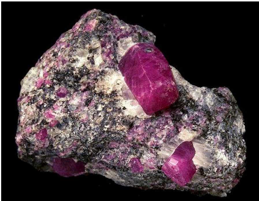
Figure N°1- Ruby

The poor quality of corundum, that is all that can not be used as a jewel is used in the manufacture of abrasive due to its great hardness, close to that of diamond.