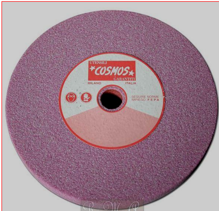
Figure N°4 – Grinding wheel in pink corundum

Generally you can use higher feed rates (up to 50% more), in fact, higher feeds are more cutting pressures that facilitate the crushing of the crystal of abrasive.